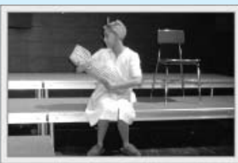
"Mother Clara Hale" of New York City's Hale House brought tears to the audience's eyes.

Blake is divided into magnet art students and students from the surrounding public housing community enrolled in a general curriculum. Holland & Knight decided to infuse that general curriculum with an arts program of its own. We partnered with StageWorks, a theater company in Tampa Bay. Their actors and educators worked with