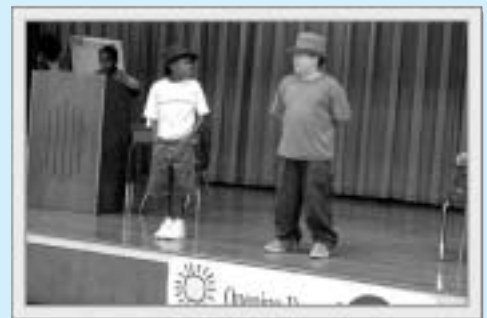
Students from North Fork Elementary in Ft. Lauderdale act out their book reports as part of the First Chapter program at a special ceremony held at the school.