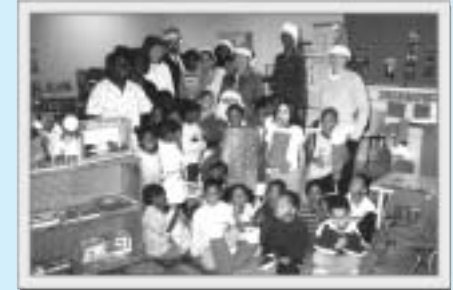
West Palm Beach